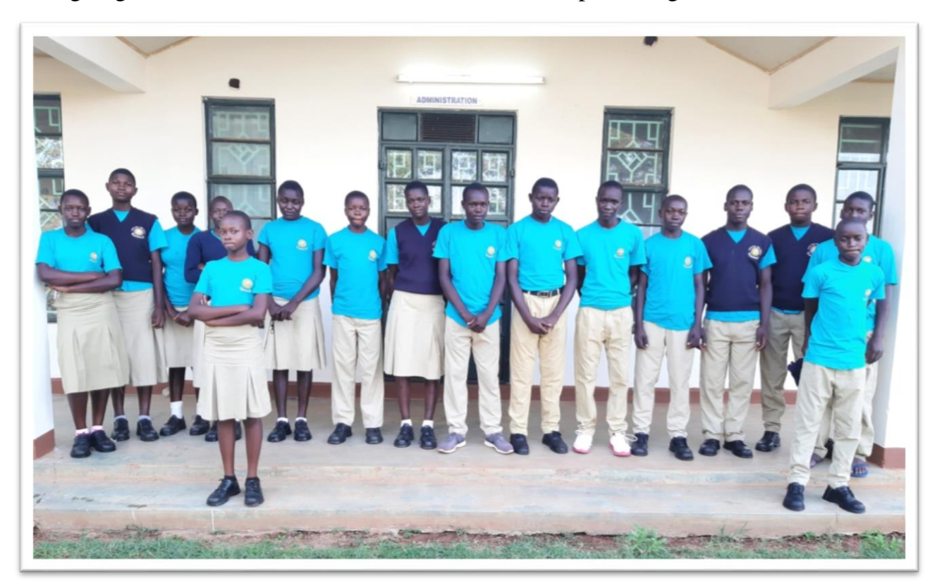
Students Needing Sponsoring

P.S Check out our webpage at livinghopehighschool.org and our monthly newsletter to find out what is going on at the school and the students that need sponsoring.